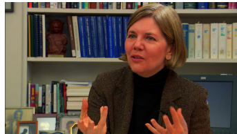
Elizabeth Warren, Harvard Law Professor and author of The Two Income Trap and The Fragile Middle Class