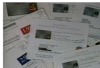
Credit card applications kept coming even after Jane O’Donnel’s son committed suicide because of credit card debts incurred in college.