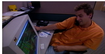
A debt collector from “People First Recoveries” pulling up info on a customer as he calls to ask for payment.