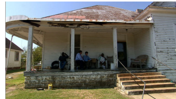
Victims of predatory lending in Macon, Mississippi