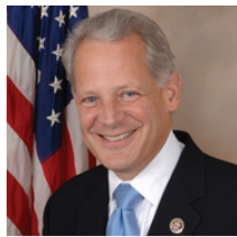
Hon. Steve Israel U.S. House of Representatives