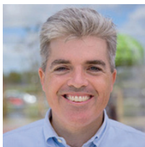
Hon. Steve Bellone Suffolk County Executive