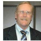
Hon. Ralph Eckstrand Village of Farmingdale Mayor