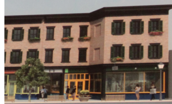
Downtown on Main, Smithtown DC5 Properties