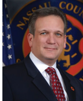
Hon. Ed Mangano Nassau County Executive