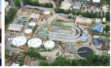
Great Neck Sewer District