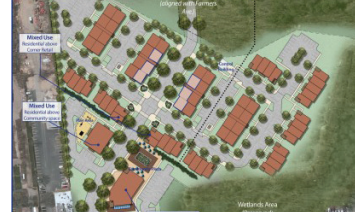
Wincoram Commons Town of Brookhaven, Conifer Realty, Coram Civic Association, CDC of LI