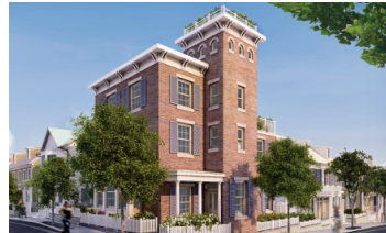
Watchcase, Sag Harbor

Register Today! Sponsorships are available! 631-261-0242