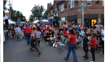
Envision Valley Stream