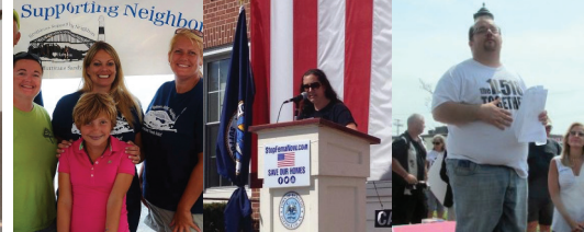
Neighbors Supporting Neighbors, Babylon Sandy Support Massapequa Style 11518 East Rockaway