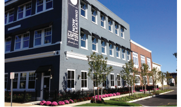
Bayshore Revitalization Greenview Properties