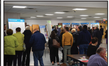
Baldwin Revitalization Nassau County & Town of Hempstead