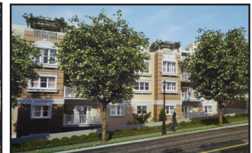
The Villas at Glen Cove Livingston Development Group

Register Today! Sponsorships and Journal Ad Space is available! 631-261-0242