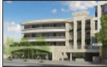
TOD Zoning, Great Neck Plaza Village of Great Neck Plaza & Nemat Development