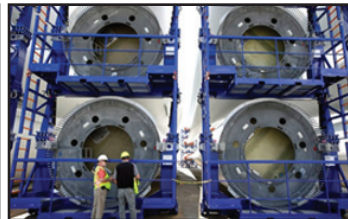
South Fork Offshore Wind Farm LIPA & Deepwater Wind