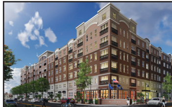
Modera, Hudson House, Searing Ave, Mineola Village of Mineola & Mill Creek Residential