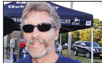
CLIMB Concerned LI Mountain Bicyclists