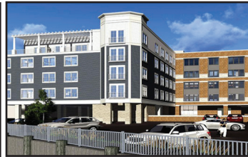
Peconic Crossing, Riverhead Town of Riverhead & Conifer Realty