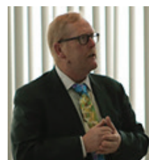
Hon. Ralph Ekstrand Mayor, Village of Farmingdale Mayor, Village of Port Jefferson