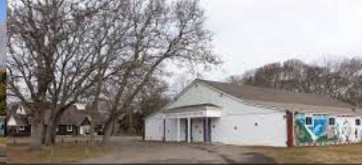
Shinnecock Community Center

IN THE MIDDLE OF THE RESERVATION IS OUR SERVICE SECTOR. CHURCH ST. BISECTS THE SERVICE SECTOR.