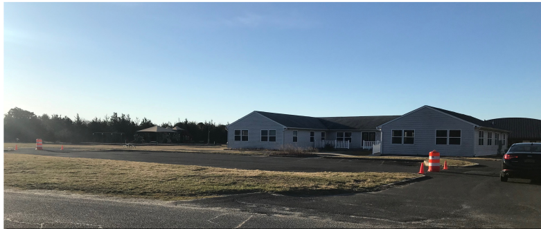
Family Preservation Center