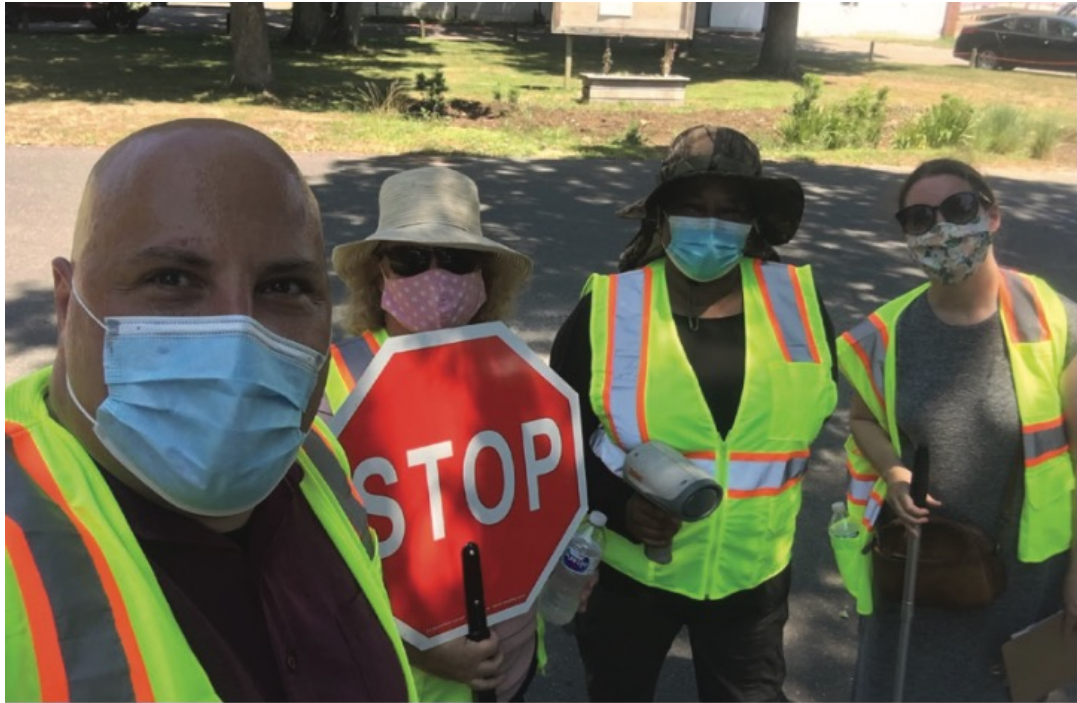
Walk Audit Team