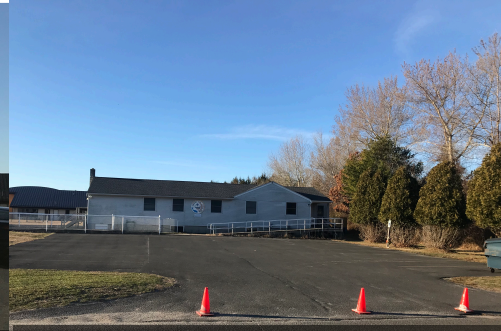
Shinnecock Health Clinic