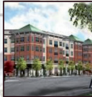
Revitalizing Communities: Alexan @ West Hempstead, Trammell Crow Residential