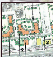
Transportation Choices: Ronkonkoma HUB, Town of Brookhaven, VHB