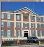
Green Building: Village Hall, Village of Amityville