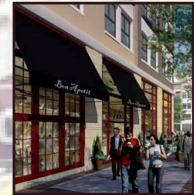
Mix of Uses: Patchogue Village Center, TRITEC