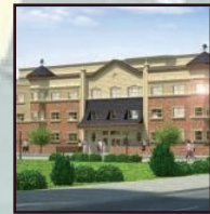
Compact Design: Hawthorne Court, Dennis Organization, Valley Stream