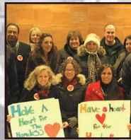
Range of Housing Types: Nassau Suffolk Coalition for the Homeless