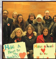
Range of Housing Types: Nassau Suffolk Coalition for the Homeless