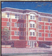
Encouraging Walkability: Marquis at Mineola, Kingdom Family Holdings